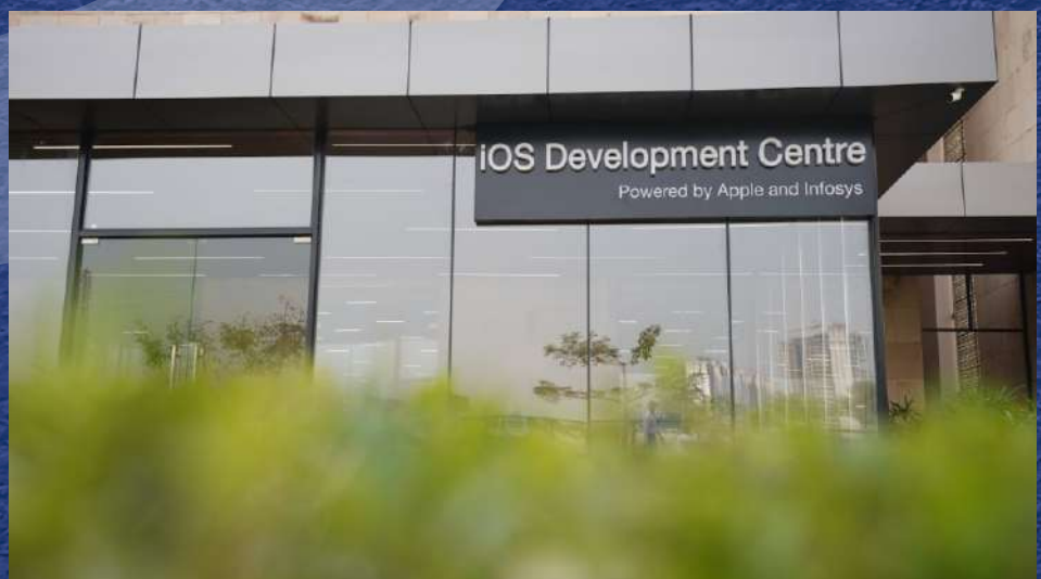
Galgotias University Partners with Apple Inc. to Establish State's First iOS Development Centre

In 2024, Galgotias University achieved remarkable milestones that align with SDG 17 by fostering global collaborations and delivering impactful educational outcomes. With over 4,500 students placed in 750+ esteemed organizations, the university has strengthened industry-academic linkages, driving professional growth and innovation. Home to 40,000+ students on a state-of-the-art 52-acre campus, Galgotias remains a hub for knowledge exchange and international engagement. The university's recognition as the 45th top institution in India by Times Higher Education and its prestigious inclusion in the QS Asia Rankings 2025 reflect its commitment to global standards of academic excellence. By collaborating with leading organizations, nurturing industry-ready graduates, and fostering cross-border partnerships, Galgotias University exemplifies the spirit of SDG 17—revitalizing global partnerships for sustainable development. Through these initiatives, Galgotias is empowering the next generation to address global challenges and create a brighter, sustainable future.