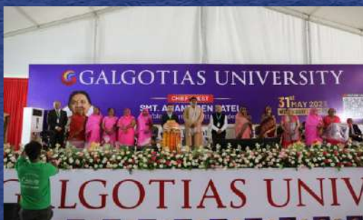
International Institution Delegation Visits