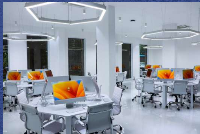
Mac Lab, B Block, Galgotias University Campus, India

Galgotias University has proudly signed a landmark Memorandum of Understanding (MoU) with Apple Inc., marking a significant step toward advancing technology education and innovation. This collaboration establishes the first iOS Development Centre in the state, a state-of-the-art facility designed to equip students with cutting-edge skills in iOS application development. The MoU symbolizes a strategic alliance aimed at fostering excellence in education, integrating Apple's global expertise in design and technology with Galgotias University's commitment to academic innovation. This partnership not only enhances the university's curriculum but also provides students with unique opportunities to engage in hands-on learning, entrepreneurial ventures, and exposure to industry best practices. The initiative underscores Galgotias University's vision of bridging the gap between academia and industry, paving the way for transformative contributions to the field of technology.